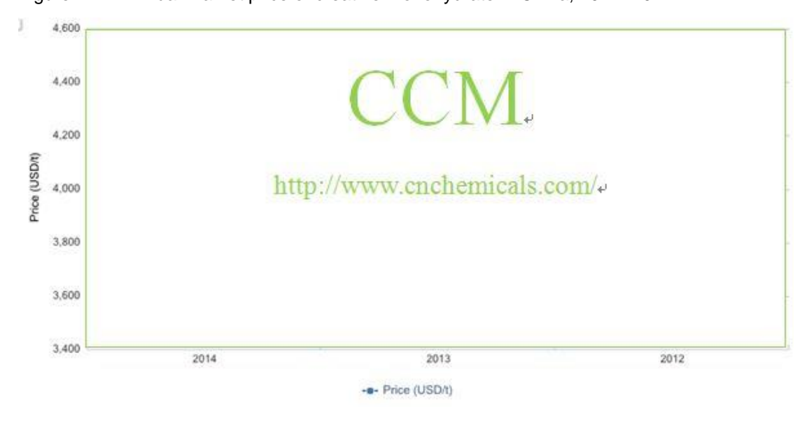
Figure 4.1-1 Annual market price of creatine monohydrate in China, 2012–2014